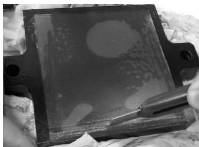
Figure 2: Original mould.

In Fig. 2 we can see a sheet from the original mould, from which a sample is removed in a state where it can be easily pulled from the mould and allowed to bake in oven at 140 °C for 12 hours.