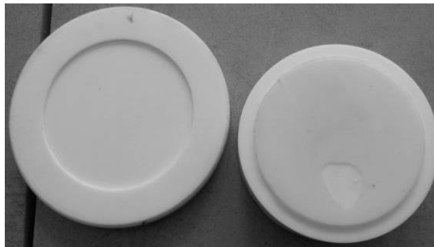
Figure 3: Teflon without the possibility of air leak.

Based on the good experience with Teflon new moulds of Teflon were made. Precisely lathed parts of mould were used to determine a gap see fig. 3. Problem has arisen during production of the first sample, because the air could not escape. On the sample appeared large clusters of bubbles, and therefore these samples were not suitable for the measurement.