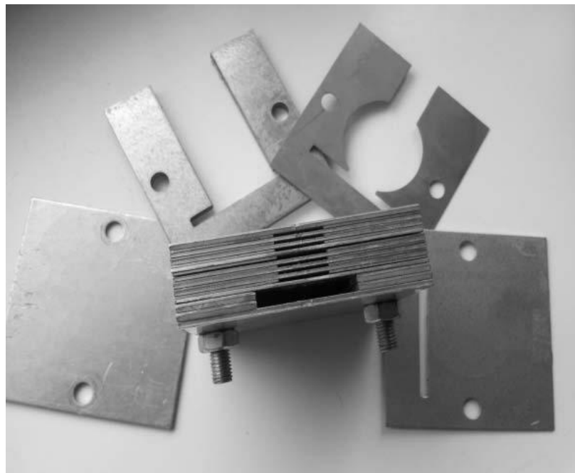
Figure 6: New metallic form with four special parts

Form with the silicon sides is more than suitable for production of thin high-quality samples. The main disadvantage of this mold is number of samples, which can be created from one casting. The core advantages of sample are thin structure, easy measurement and easily observable dielectric characteristics. It was necessary to design a new larger mold, which could produce a set of samples from one casting, so we could easily measure error rate.