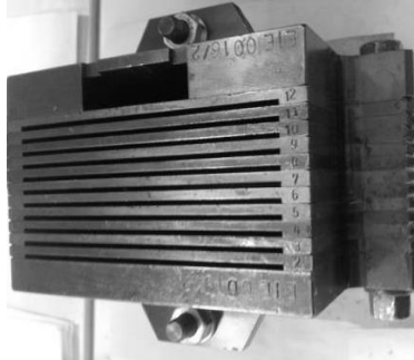
Figure 1: The original mould from ABB Comp.

sample production process. The original mould satisfied important requirements such as virtually no roughness of the surface material of the mould, high durability and simple disassembly. However, the thickness of samples produced in this original mould was approximately 2 mm. The capacitance of these samples was of the order of 3 pF, which was below the measurement capabilities of the LCR bridge. It was, therefore, important to decrease the sample thickness to as low as possible, to approximately 100 – 500 \mu\text{m} . This was experimentally achieved by grinding original samples off. However, in the grinding process we experienced large material losses, and samples also suffered from susceptibility to cracking.