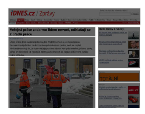
Figure 2: two columns layout with smaller blocks

more blocks. Each block is represented its width, height and position. This method does not use any visual features because this method is used as a pre-prosessing part of the proper comparison based on visual features.